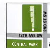
Artist rendering only. This is not an offering for sale. E & O E.

Own a new local landmark. Overlook the sparkling Calgary skyline from Park Point's unique setting and feel secure by investing in unobstructed views atop rare protected green space. At night, enjoy starlight from your iconic urban tower. By day, soak in the natural sunlight and blue skies while contemplating the gardens and places to venture to below.