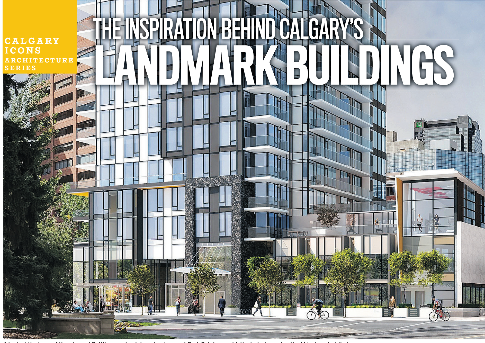
A look at the base of the planned Beltline condominium development Park Point, a sophisticated, glass-sheathed black and white tower.