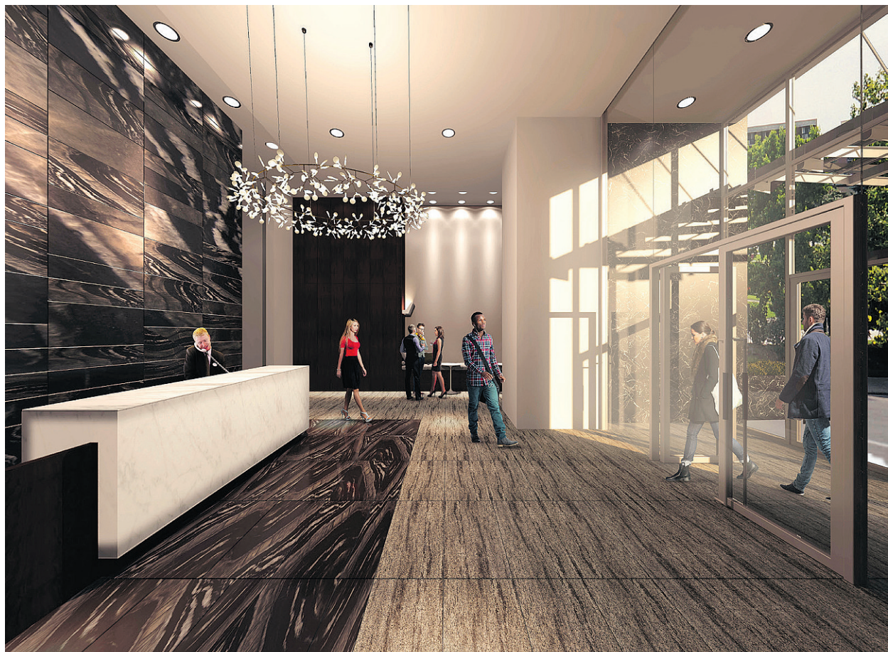
Inside Park Point's two-storey lobby, a large chandelier will shine 24/7.

sculpture," says Wai. Strong vertical architecture is created in two ways. The first includes architectural definition through design the floor plates grow in size as they ascend the building, creating an outwardly stepped effect. Secondly, the longitudinal colour schemata comprised of three-dimensional alternating of black and white vertical blocks — the black colour plate on the facade juts out three and half feet from the white colour plate - draws the eyes in a vertical fashion, while bands of horizontal colours including orange, yellow and brown infuse warmth and pick up on the historical nature of the surrounding brick warehouse buildings.