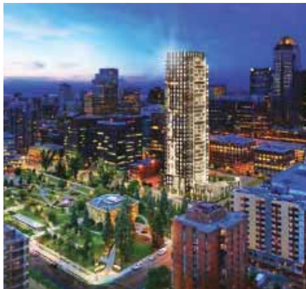
The Park Point tower will ascend 34 storeys in downtown Calgary.

There has been a bright spot in the storm clouds: prices for both construction labour and material