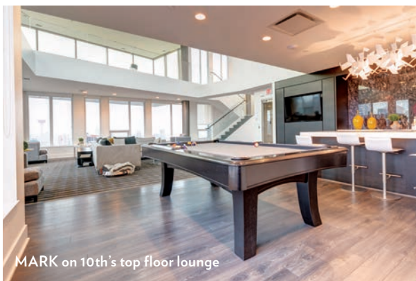
MARK on 10th's top floor lounge

Qualex Landmark™ has been key in modernizing the Beltline, providing some of the most modern condo options here, including Nova, Stella, Luna, Calla, and MARK on 10th. This continues with their Park Point twin high-rises along 11 Avenue S.W. CL