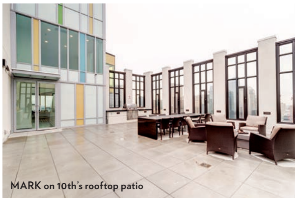
MARK on 10th's rooftop patio