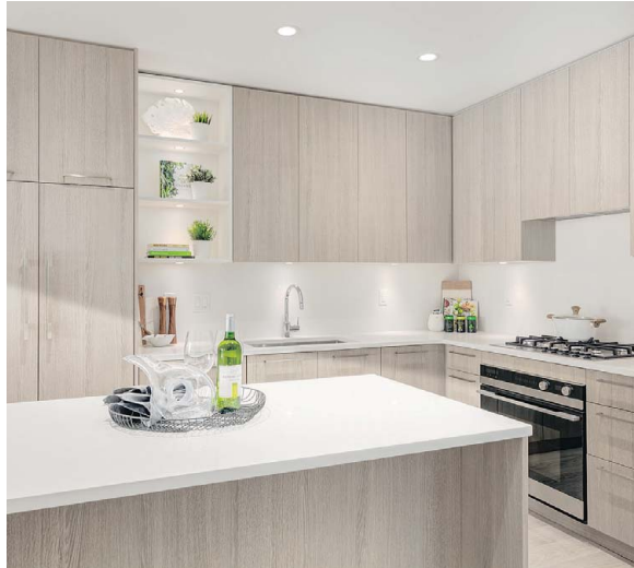
Green on Queensbury in North Vancouver is made up of 164 condo units in a variety of sizes and configurations.