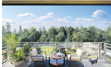
An artist's rendering of an outdoor space at Green on Queensbury. The project will overlook the five-acre Moodyville Park.