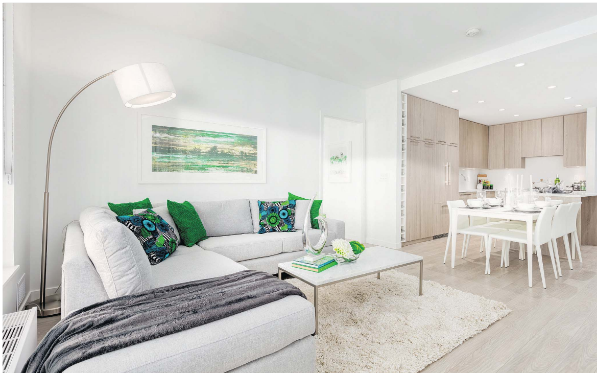
Green on Queensbury is a project from Qualex Landmark Northern Limited Partnership in North Vancouver.