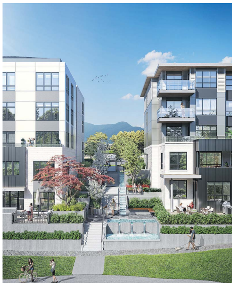
Green on Queensbury will comprise 164 residences in three four-storey buildings overlooking five acres of parkland.

The long-overlooked area actually has a surprisingly colourful history. Considered the birthplace of North Vancouver, Moodyville was the spot where the city’s first European settlers worked and lived. That first community included a colourful American entrepreneur named Sewell Moody, who, in 1865, bought a sawmill that turned out massive beams from locally logged cedar, hemlock and fir