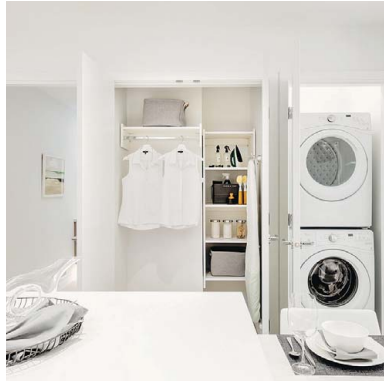
Plenty of storage will be on offer at Green on Queensbury.