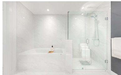
The generously-proportioned bathrooms in Green on Queensbury feature soaker tubs and rainfall showers.