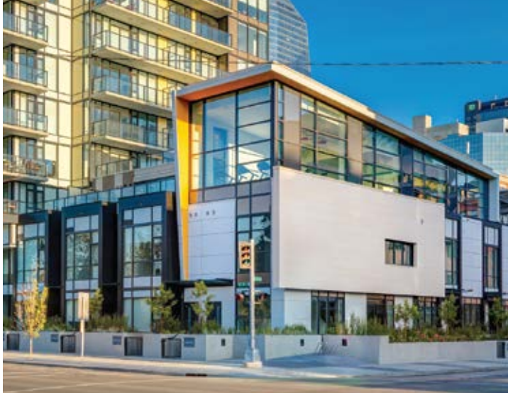
9,000 sf of indoor/outdoor amenities

Amenity spaces at Park Point continue to exceed expectations in terms of quality and design, offering a true luxury resort lifestyle.