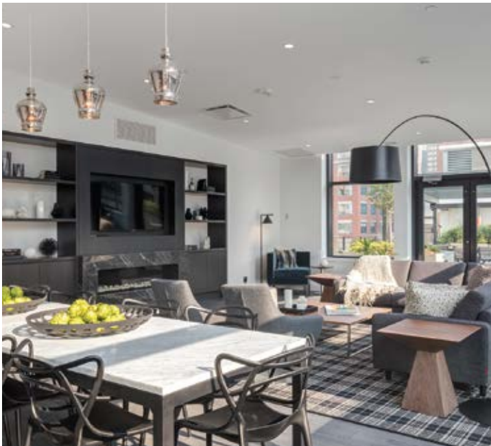
Lounge with kitchen, dining and entertainment centre