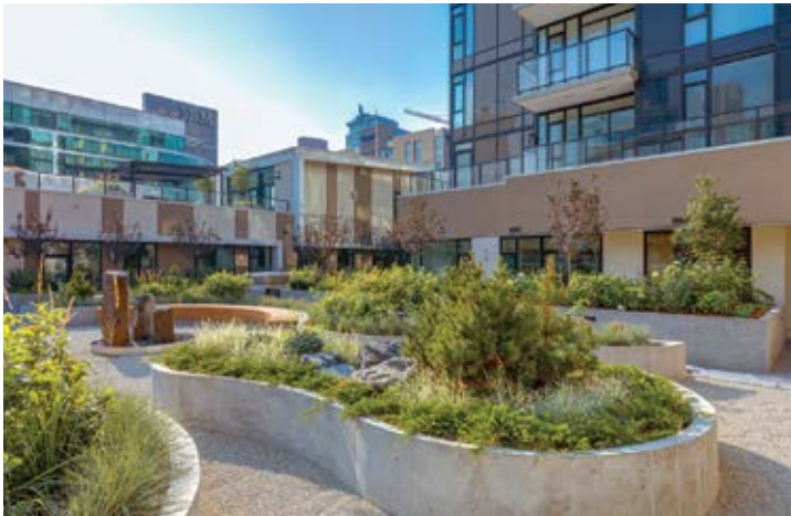
Rooftop zen terrace with bench seating and water feature