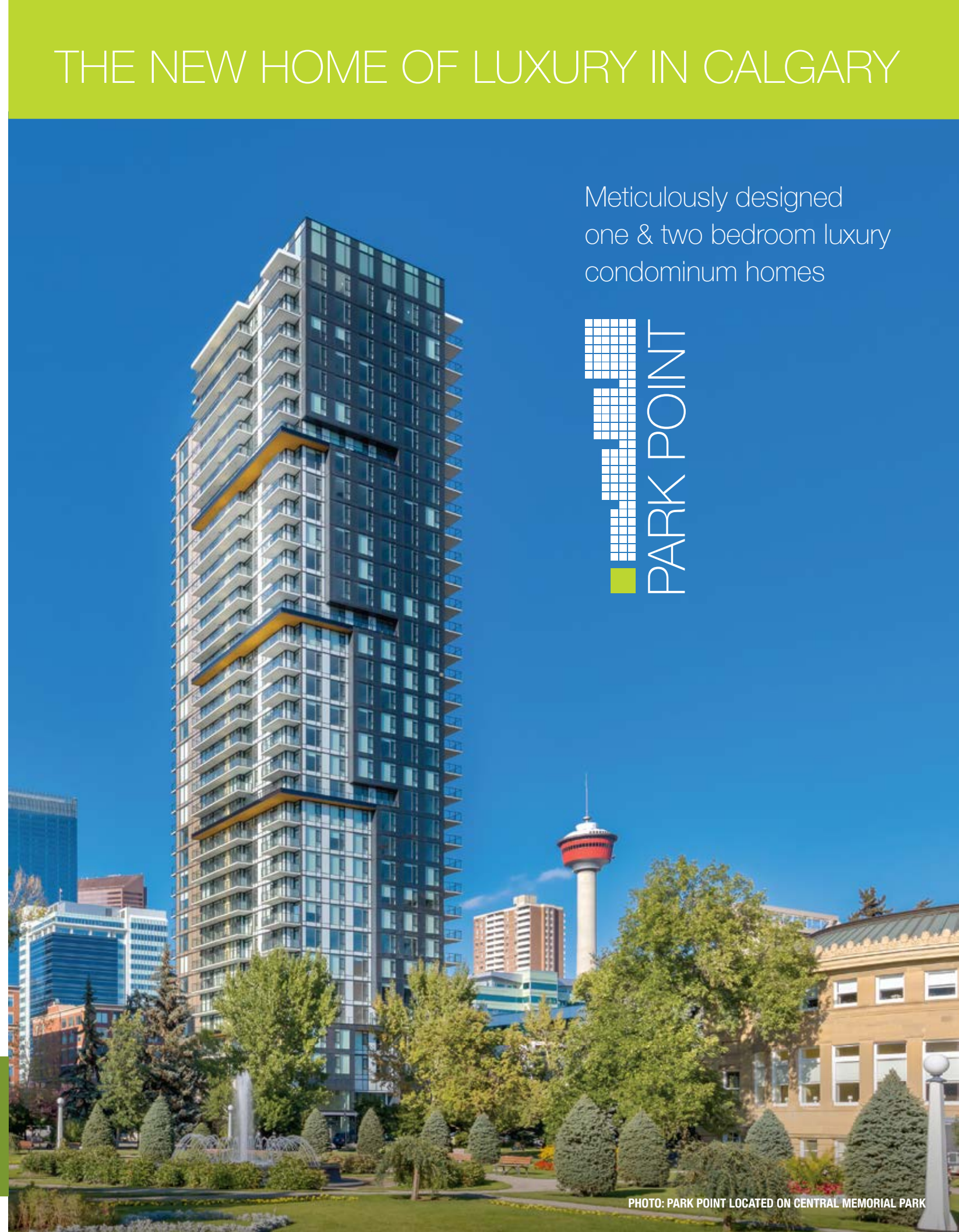
PHOTO: PARK POINT LOCATED ON CENTRAL MEMORIAL PARK