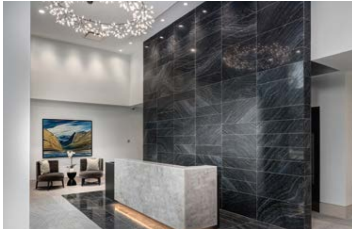
Luxury hotel-inspired double-height lobby