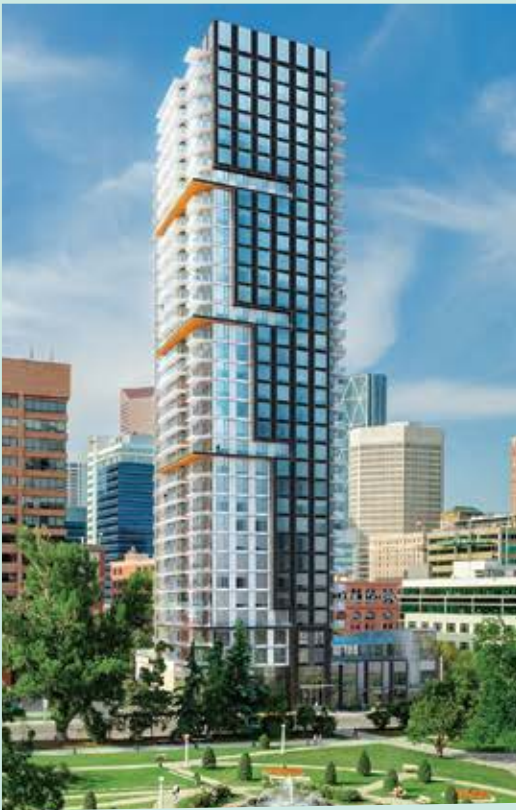
PARK POINT, CALGARY