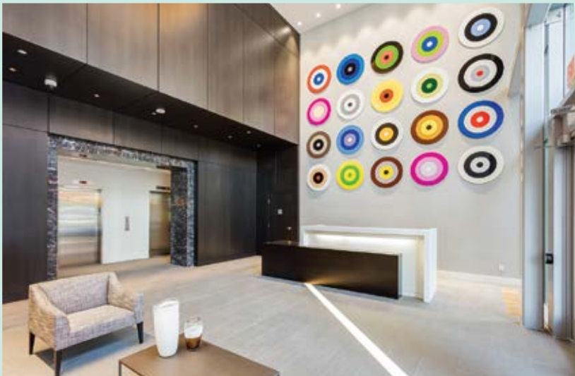
MARK ON 10TH LOBBY, CALGARY (FEATURING ART BY DOUGLAS COUPLAND)