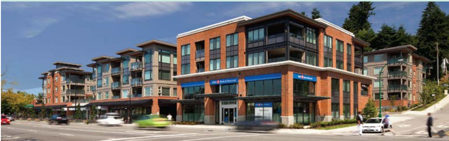
DISTRICT CROSSING, NORTH VANCOUVER

The Qualex-Landmark™ group has more than a quarter century of residential and commercial development experience in the highly competitive British Columbia and Alberta markets. With accolades from customers and peers alike, they have earned a notable reputation for innovative design and dedication to customer satisfaction. Care and attention to every detail extends to all aspects of the Qualex-Landmark™ group's work, from beautiful interiors to functional layouts and striking architecture. Recent works in their award-winning and distinctive portfolio includes District Crossing in North Vancouver, Domus, Pomaria and ARIA in downtown Vancouver, and Park Point and Mark on 10th in Calgary. More projects: www.qualex.ca .