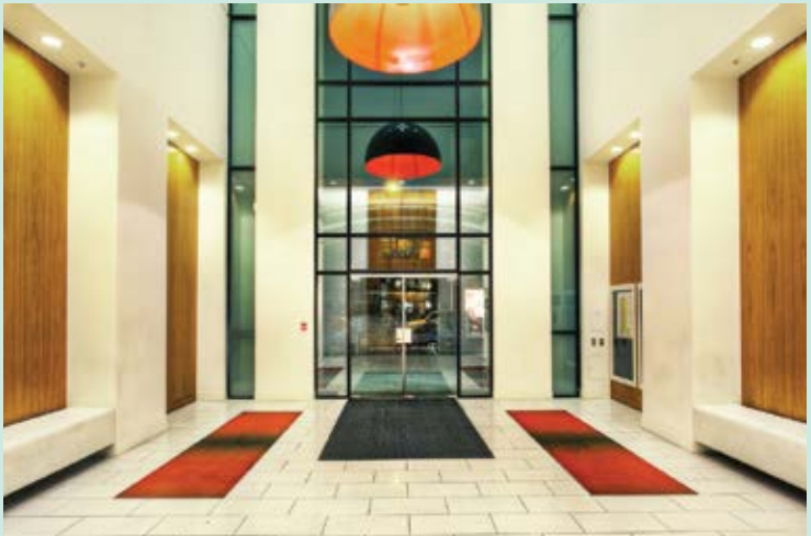
DOMUS LOBBY, VANCOUVER