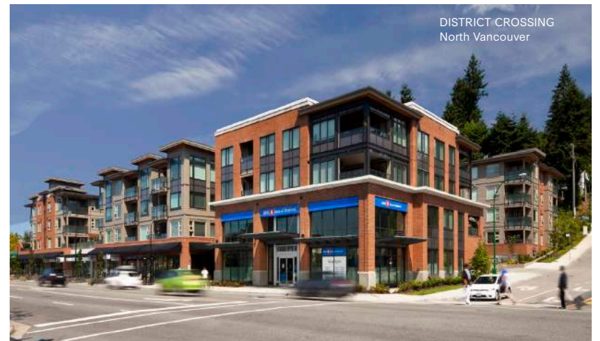
DISTRICT CROSSING North Vancouver