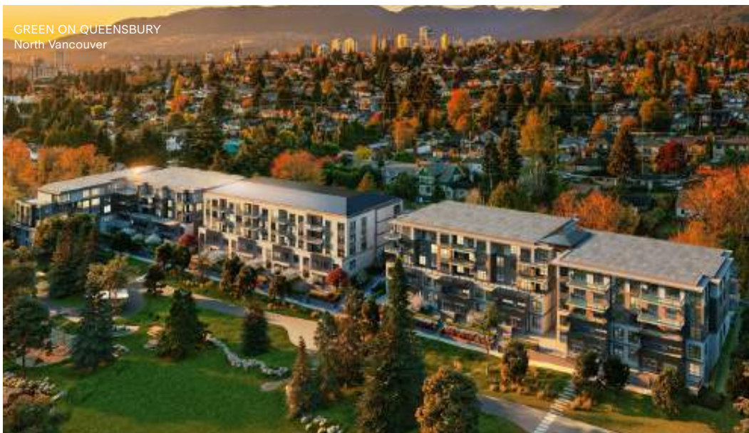
GREEN ON QUEENSBURY North Vancouver